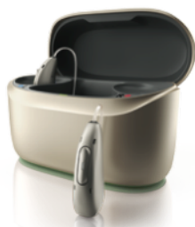
Phonak ChargerGo RIC Infinio with built-in battery for charging on the go