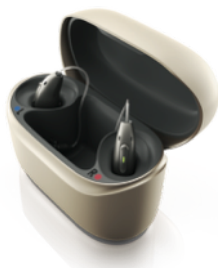
Phonak Charger RIC Infinio for cable charging